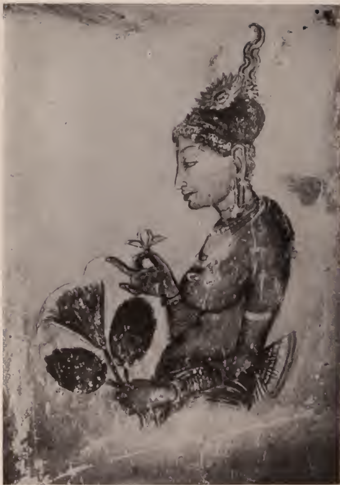
FRESCO FROM SIGIRIYA, CEYLON (FIFTH CENTURY).